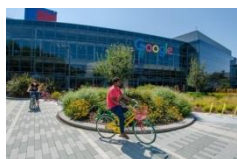
Googleplex (the headquarter of Google in Mountain View)

Sightseeing tour through the Silicon Valley