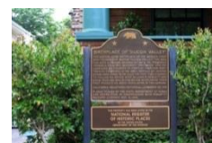
HP-Garage – birthplace of the Silicon Valley. The garage in which the famous computer company Hewlett & Packard was founded

Computer History Museum – established in 1996 in Mountain View. The museum is dedicated to preserving and presenting the stories and artifacts of the information age, and exploring the computing revolution and its impact on society. It is one of the most important attractions in the Valley.