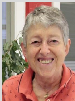
Traudel Knoblauch Organisation