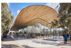
Apple Park – the recently opened Visitor Center in Cupertino